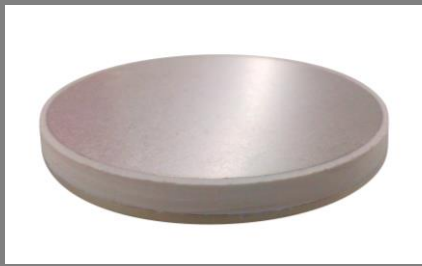
Caseless Disc Diode